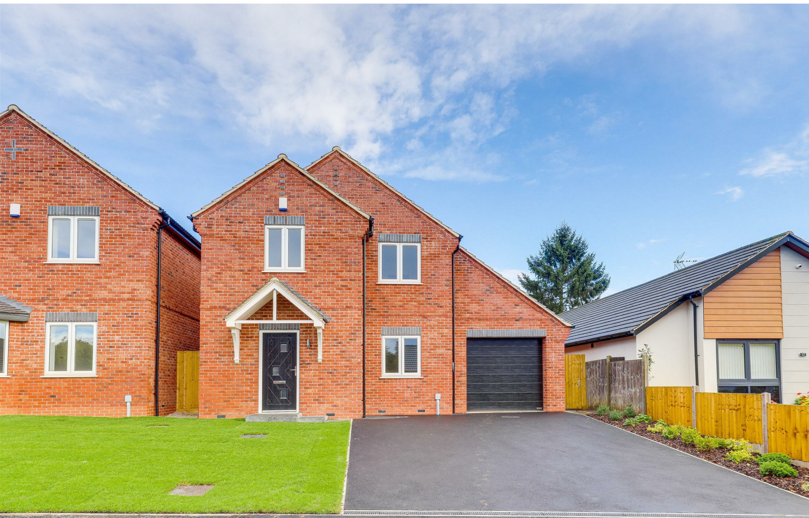
Meadow Croft Gardens, Hucknall, Nottinghamshire NG15 6UN